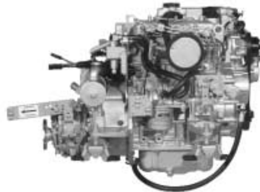
M-25XPB Diesel Engine

See other side for more dimension information Photographs may show optional equipment.