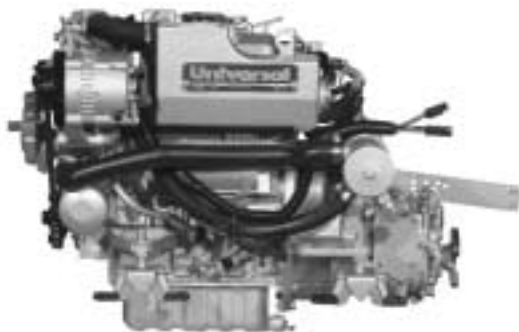
M-25XPB Diesel Engine

** Universal Atomic-4 replacements are not direct drop-ins in all cases. Some engine compartment reconfiguration may be required.