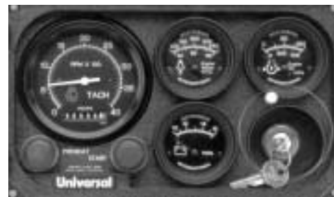
Optional Admiral Panel